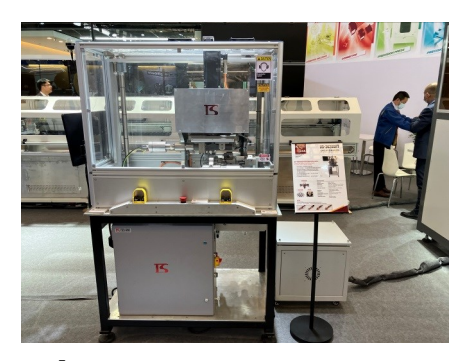
[Ultra sonic welding technology by our partner manufacturer TECH-SONIC could be linked to a new connection technology.]