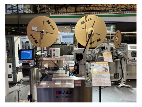
[The CPR-F-ZERO high-speed doubleend crimping machine, which was unveiled for the first time in China, attracted much attention from visitors.]