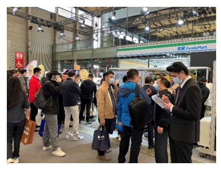
[Many customers visited our booth every day, who eagerly observed the operation of the exhibited machines.]